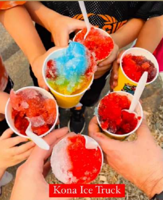
Kona Ice Truck